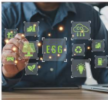
ESG & Sustainability