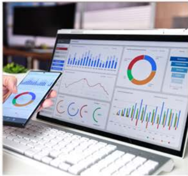
Business Intelligence & Analytics